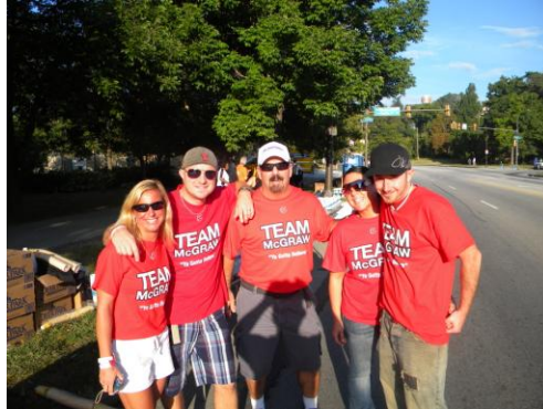
Team Screwball volunteering at the ING Rock & Roll Philadelphia ½ Marathon

As the summer came to an end, Team McGraw battled on against this terrible disease, and has vowed to do so throughout the year. On September 19 th , Team McGraw was out in force for the ING Rock & Roll Philadelphia ½ Marathon. A few dozen Team McGraw runners took to the 13.1 mile course through Philly. The Team set up a home-base tent by the starting line at the Art Museum, and also a hydration station at Mile 5 on Boathouse Row. Team Screwball manned the water station and cheered on all of the runners!